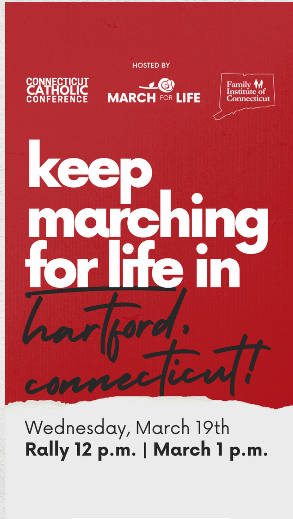
Red Story SM