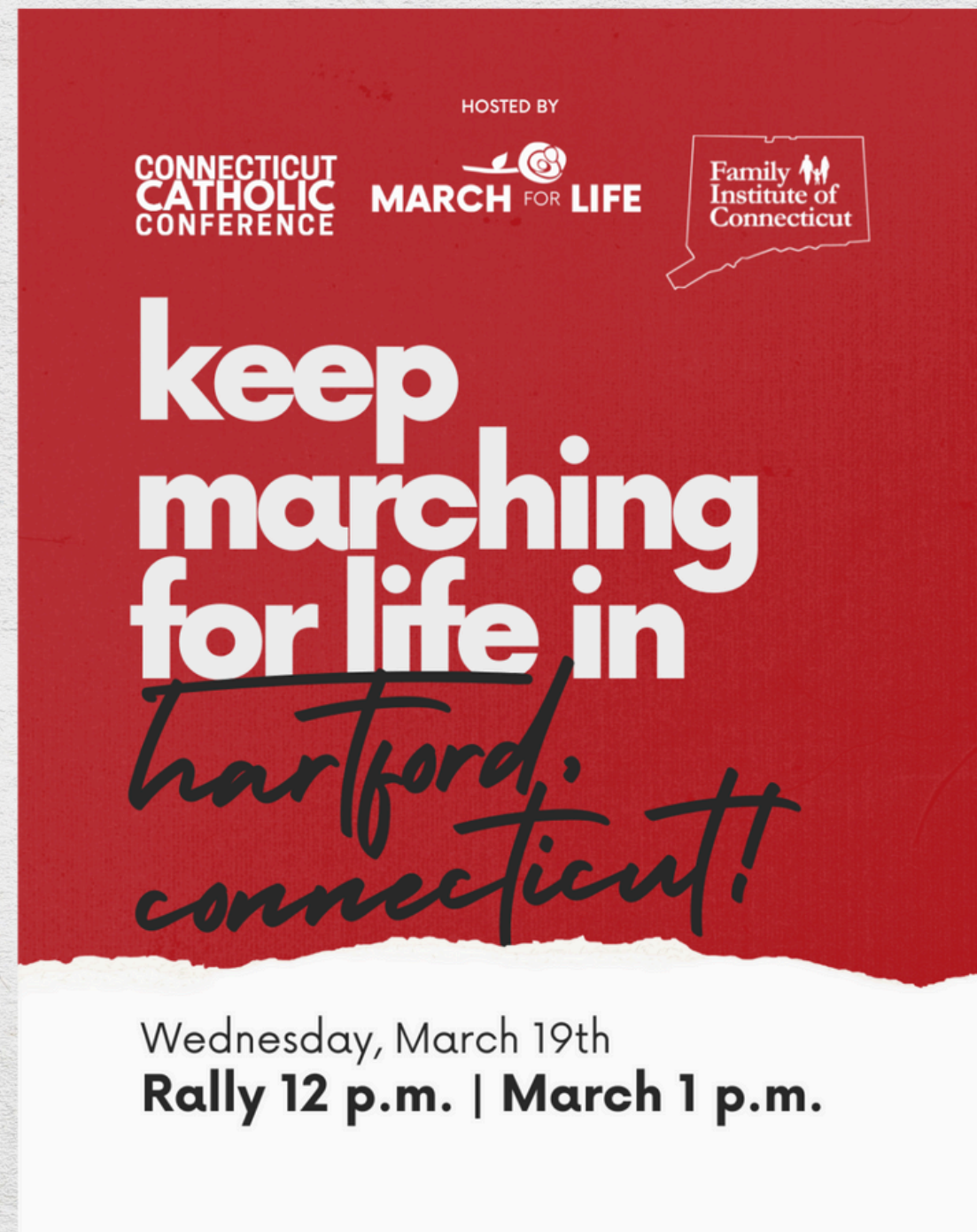
Red Portrait SM