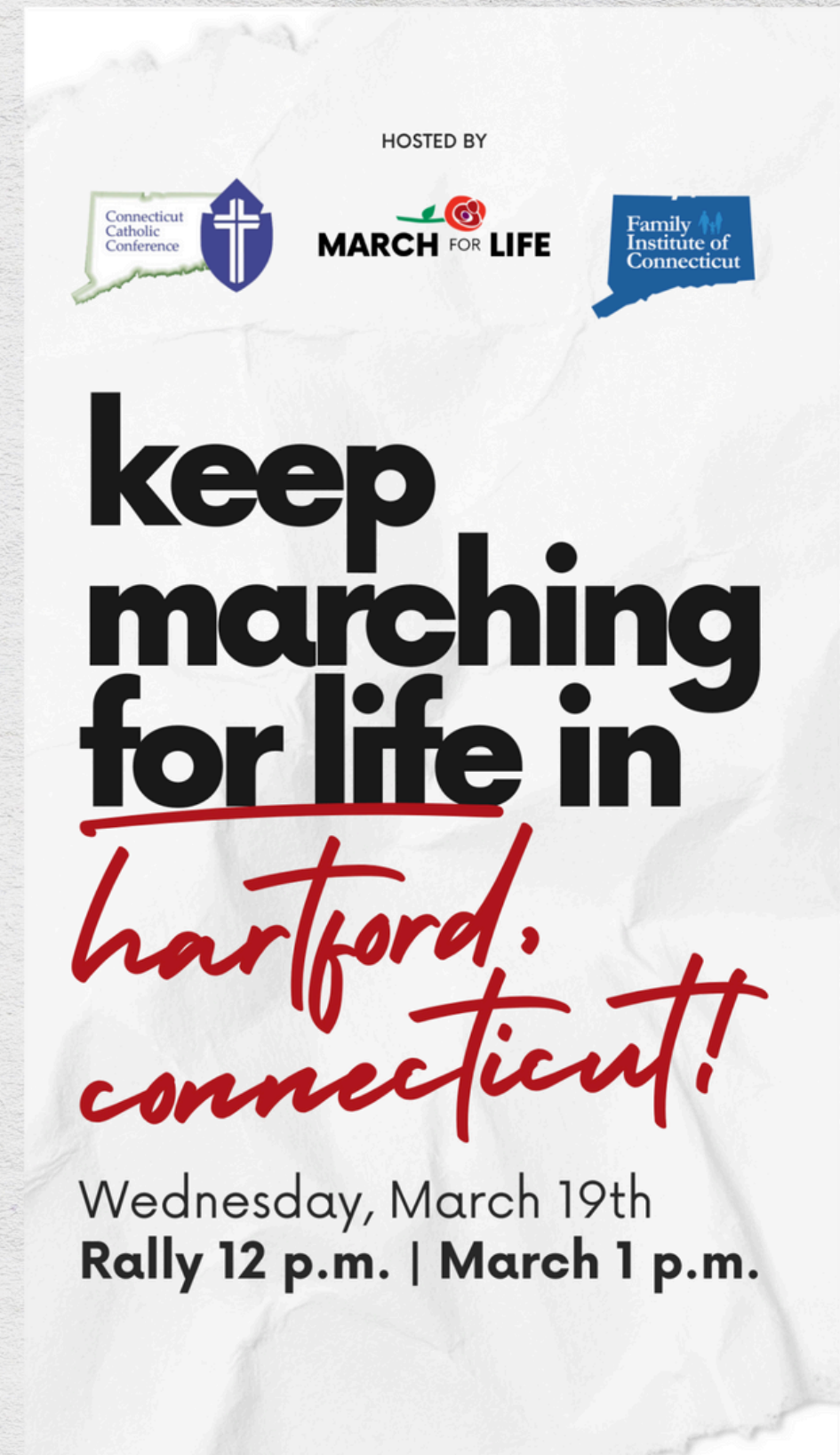
White Story SM