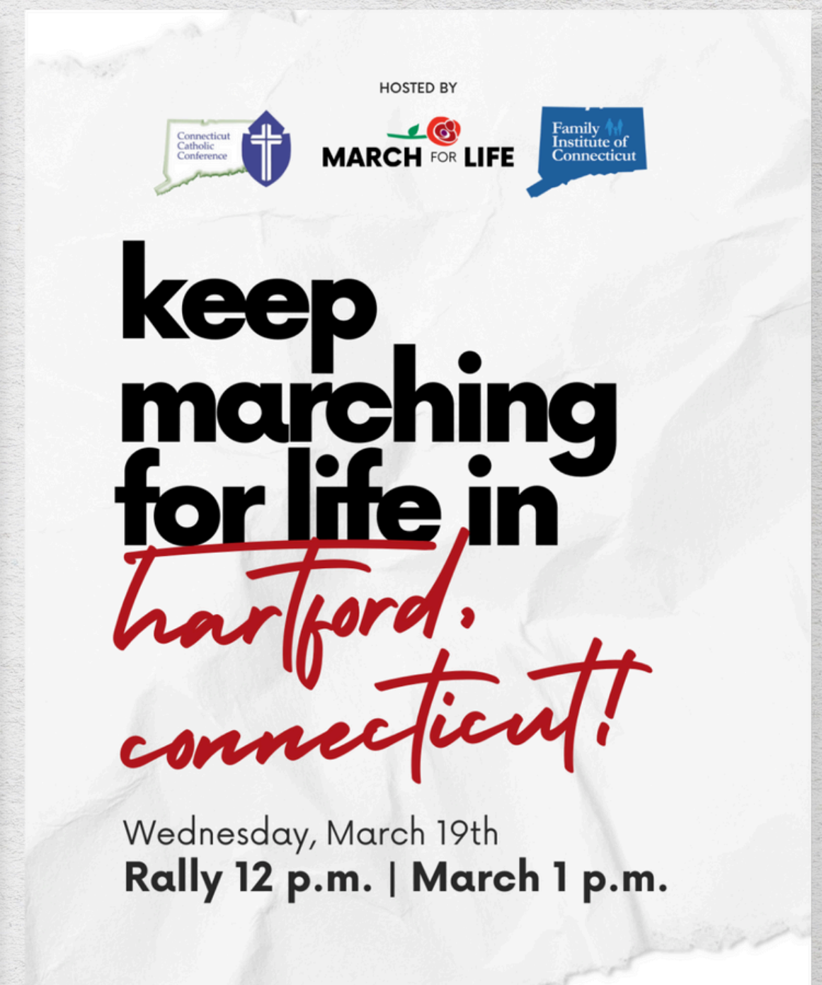
White Portrait SM